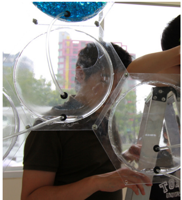
Typical Bolt & Nuts Joints