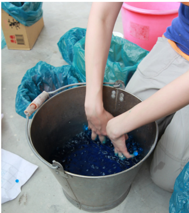
Gel Polymer with Plants Nutrients