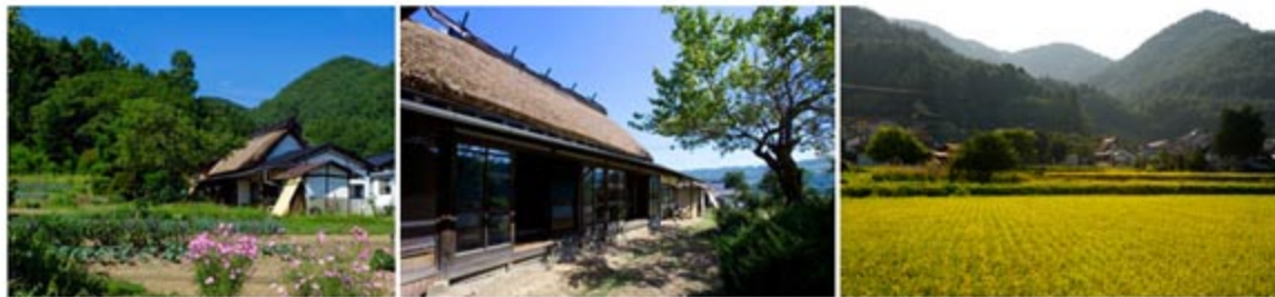
Click photos to enlarge

Our house was registered 150 years ago, in the year 1 of Meiji. However, the building itself with its different construction parts and ancient beams attests to a much more advanced age.